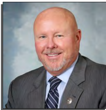
State Sen. William Burt (R-Otero)

The bill, similar to versions sponsored by Senator Burt the previous two years, seeks a phased-in deduction on military retiree income—beginning with a 25% exemption on income beginning on January 1, 2017, a 50% deduction beginning January 1, 2018, a 75% deduction beginning January 1, 2019, and a 100% deduction after January 1, 2020.