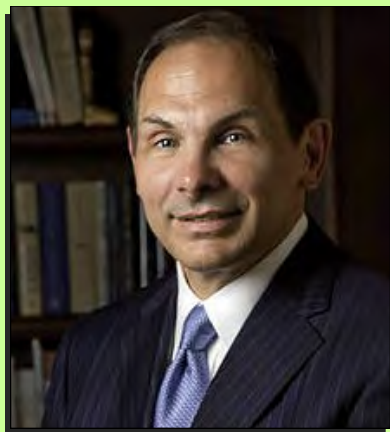
VA Secretary Robert A. McDonald

For more news from the VA and for benefits information, visit